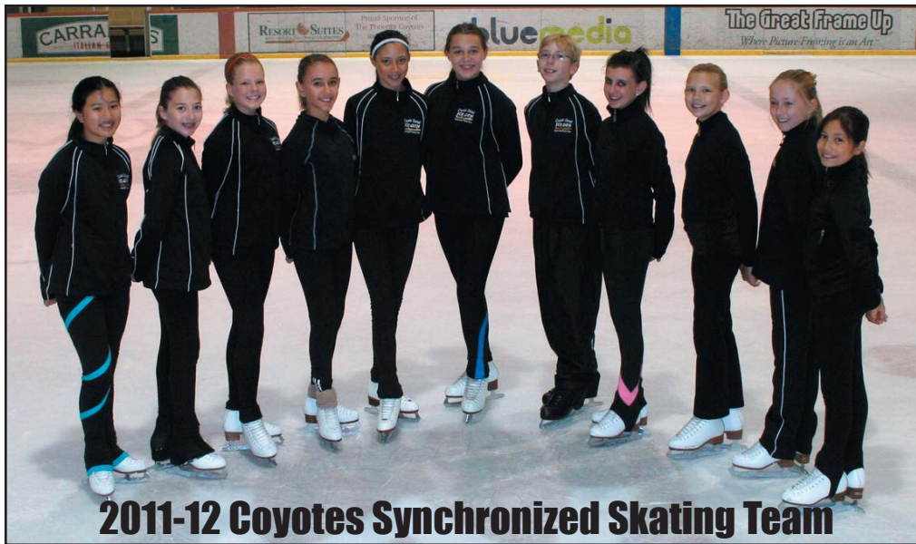
2011-12 Coyotes Synchronized Skating Team